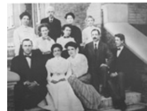
First faculty on steps of "old" Austin Building