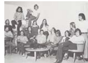
Fountainhead staff, 1975

Were you a staff writer for the paper? Did you participate in April Fool's Day pranks?