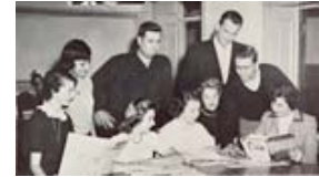
The East Carolinian staff, 1954

When April 1st falls on a publication date the student writers meet the challenge. The oldest surviving April Fool's edition of the student paper is the 1927 Teco Echo. The headline read: "Unknown Donor Gives College Ten Million! Conceals Name to Avoid Publicity; Future of Building Program Bright." Other articles on the front page include "Flapper Bandit Holds Up Young Man, Practice Teaching Removed from Curriculum" and this last item found at the bottom of page 1: