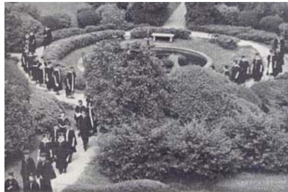
1949 commencement, processional through Wright Circle.

The Wright Circle pool was a gift from the Class of 1932.