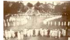
1928 Class Day Celebration

Prior to Homecoming and Founders Week there were Class Day celebrations. The first graduations were relatively small affairs with processions of the entire student body, a commencement speaker, and diplomas. With each passing year, however, more and more alumni returned for a week of events and what became known as Class Day. Most of the celebrations were held on the lawn or near the college lake.