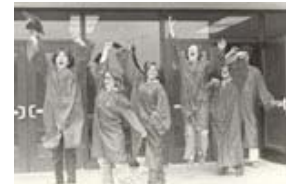
1976 Graduates Celebrating

How did you celebrate graduation at ECU?