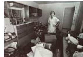
Move-in day at ECU, 1985