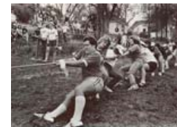
Sigma Tau Gamma tug-of-war during 1982 C Week

Do you have a memory of participating in a cal literary society, sorority, fraternity or service g If so, please share your memories and let the