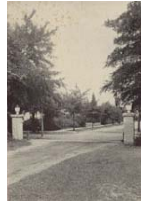
Main gates in front of Old Austin from 1931 yearbook

One of the things that ECU is known for is its architectural style. The original buildings were designed according to the instructions of Thomas Jarvis who had served as ambassador in Brazil and liked the red brick facades and tile roofs he saw there. Another architectural detail found around campus is the gates along 5th Street.