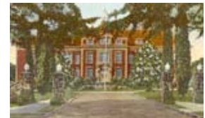
Old Austin Entrance Postcard

What scenes come to mind when you think of ECU?