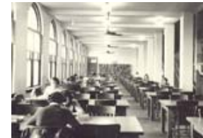
Joyner Library study area in Whichard, 1940-49.

The first library was located in a 20 x 33 foot room in Old Austin Building. This space proved adequate for the needs of the students for sixteen years. In 1924, J.Y. Joyner Library opened with nearly 14,000 square feet for books. That building served the students for 32 years as the library and it is now known as Whichard.