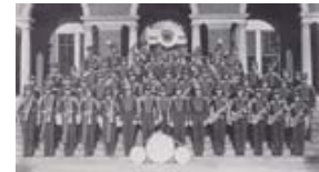
The first band appeared as the Concert Band in the 1939 Tecoon.