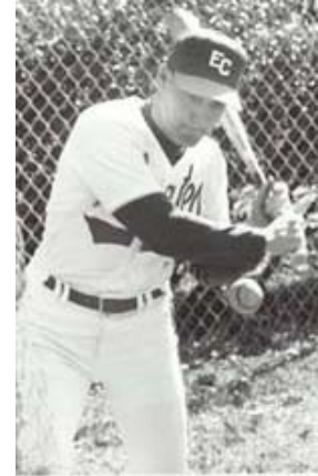
Unidentified baseball player or coach

For complete PirateFest details, visit www.piratefestnc.com .