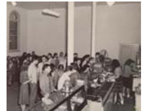
Soda Shop in the Old Cafeteria, 1947

In 1909 the dining hall was built that would become the present day "Old Cafeteria." Students paid $90 per year for board. Students were served "family style" and assigned to a specific table for several weeks at a time. They were expected to bring their own linen napkins to campus. These were washed for the students in the campus laundry. This was part of the student training for later life. Enrollments stayed around 300 until 1923 when it began steadily increasing every couple of years. Meals cost $4 per week in 1935.