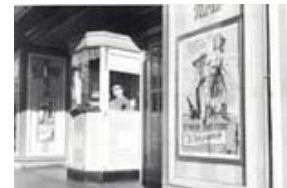
Pitt Theatre, 1958

These photos show how the town has grown up with the college, or vice versa. What was your favorite hang out? Where was the hot spot on Friday or Saturday night when you were at East Carolina? Share your memories with the University Archivist by completing the Share a Memory online form .