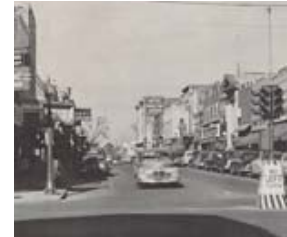
Downtown Greenville, 1951

What was Greenville like when you attended East Carolina? Students in the early days were restricted to campus except for very specific trips into town. Their perceptions of Greenville may have been limited, and became even more so when the college built a railroad spur that delivered students directly to the college instead of the depot in town. Students were encouraged to attend churches and could get special permission to stay in town on Sunday afternoons, and perhaps ride in a car. Saturdays in town were strictly regulated. Seniors were allowed to go to movies in groups, but no student was allowed to go anywhere in town alone.