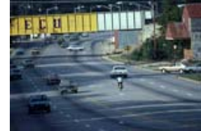
Railroad Bridge on Charles Boulevard, 1982

Popular spots in more recent decades included the Treehouse and the Attic. Darryl's, another popular hangout was on the other side of campus until Hurricane Floyd swamped it in 1999. Cubbies, BW3's and Boli's are familiar spots to our current students.